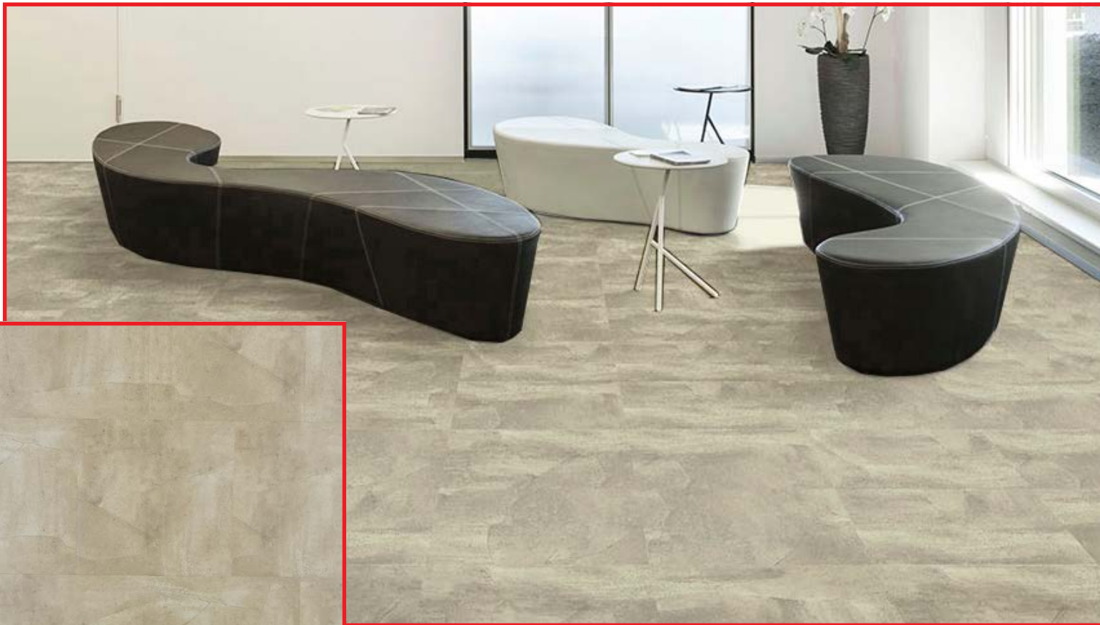
SLATE™ - 2511 AVAILABLE IN 4 COLORS