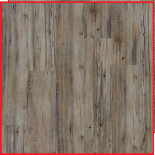
RUSTIC PINE™ - 2508 AVAILABLE IN 4 COLORS