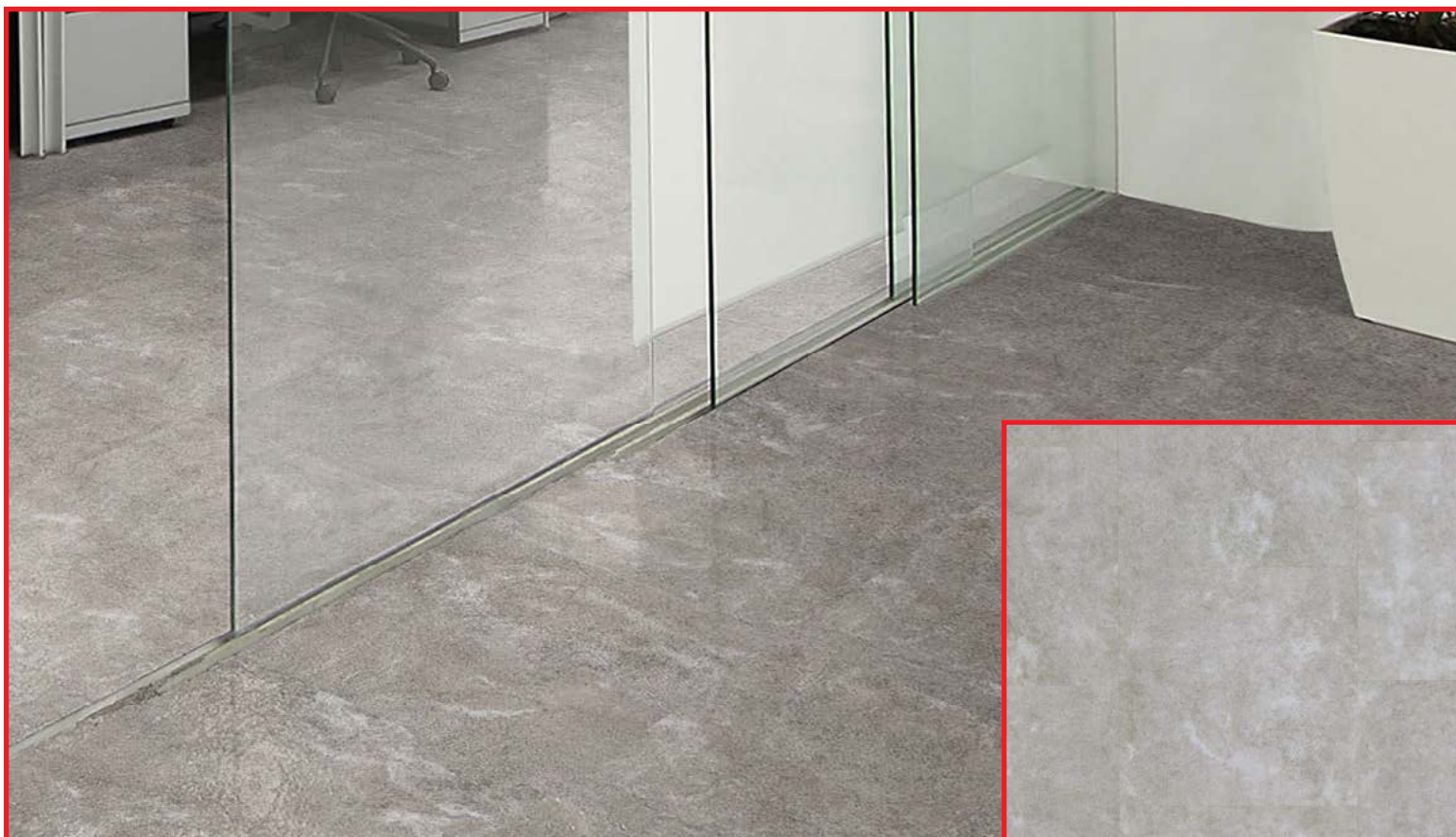
TRAVERTINE™ - 2510 AVAILABLE IN 6 COLORS