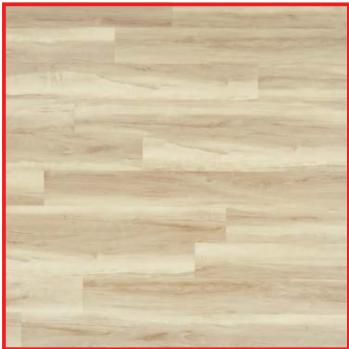
APPLEWOOD™ - 2506 AVAILABLE IN 5 COLORS