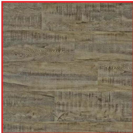
AGED OAK™ - 2504 AVAILABLE IN 3 COLORS