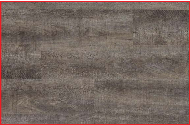
LAUREL OAK™ - 2507 AVAILABLE IN 3 COLORS