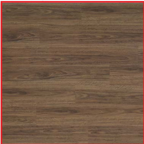
EUCALYPTUS™ - 2505 AVAILABLE IN 6 COLORS