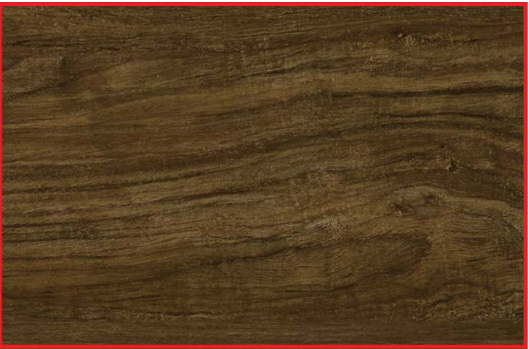
TEAK™ - 2509 AVAILABLE IN 4 COLORS