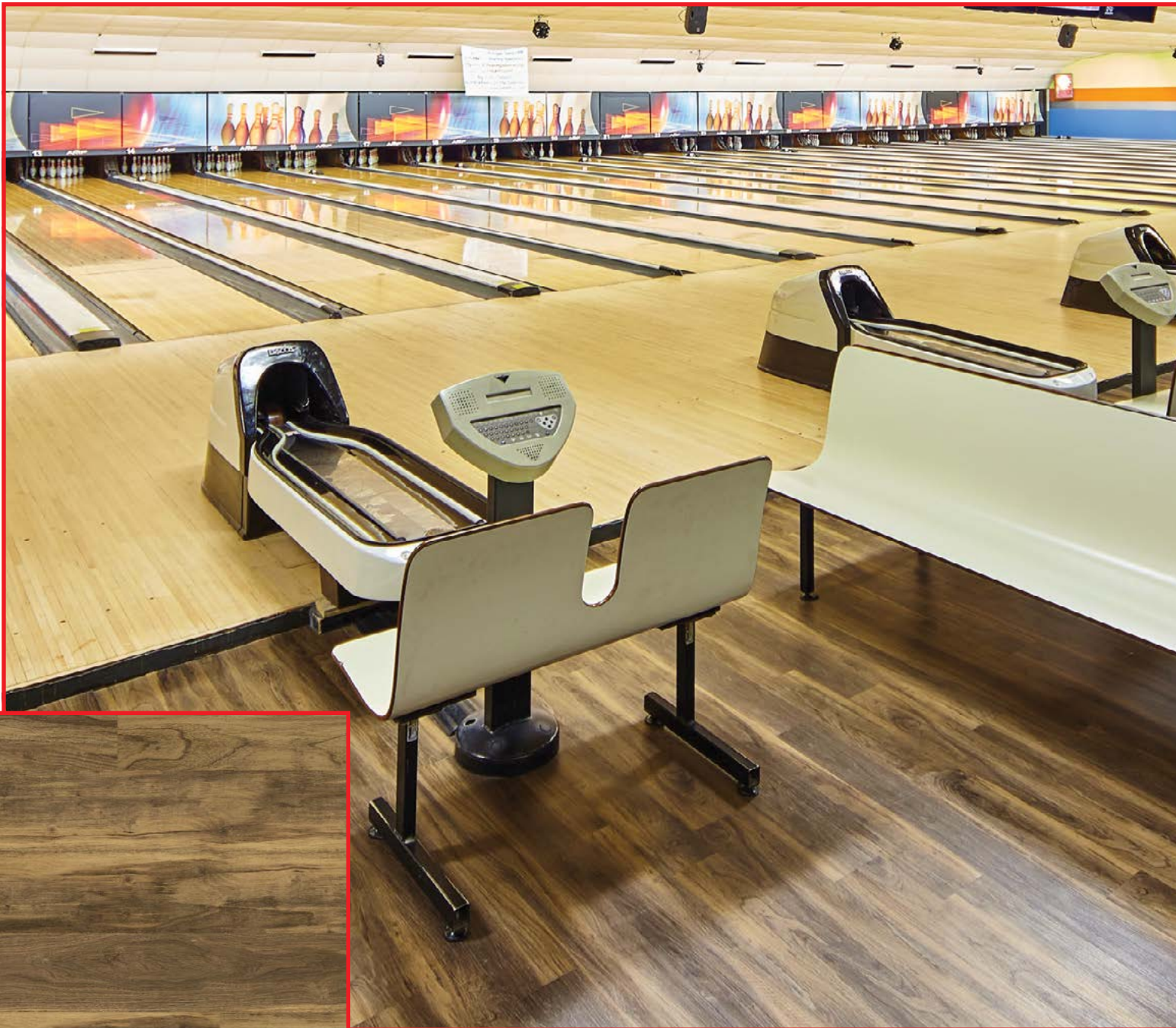
AVATAR GROVE™ - 2500 AVAILABLE IN 23 COLORS