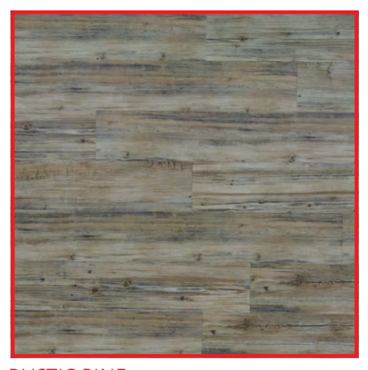
RUSTIC PINE™ - 2508 AVAILABLE IN 4 COLORS