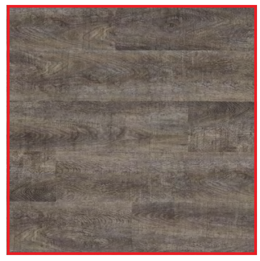
LAUREL OAK™ - 2507 AVAILABLE IN 3 COLORS