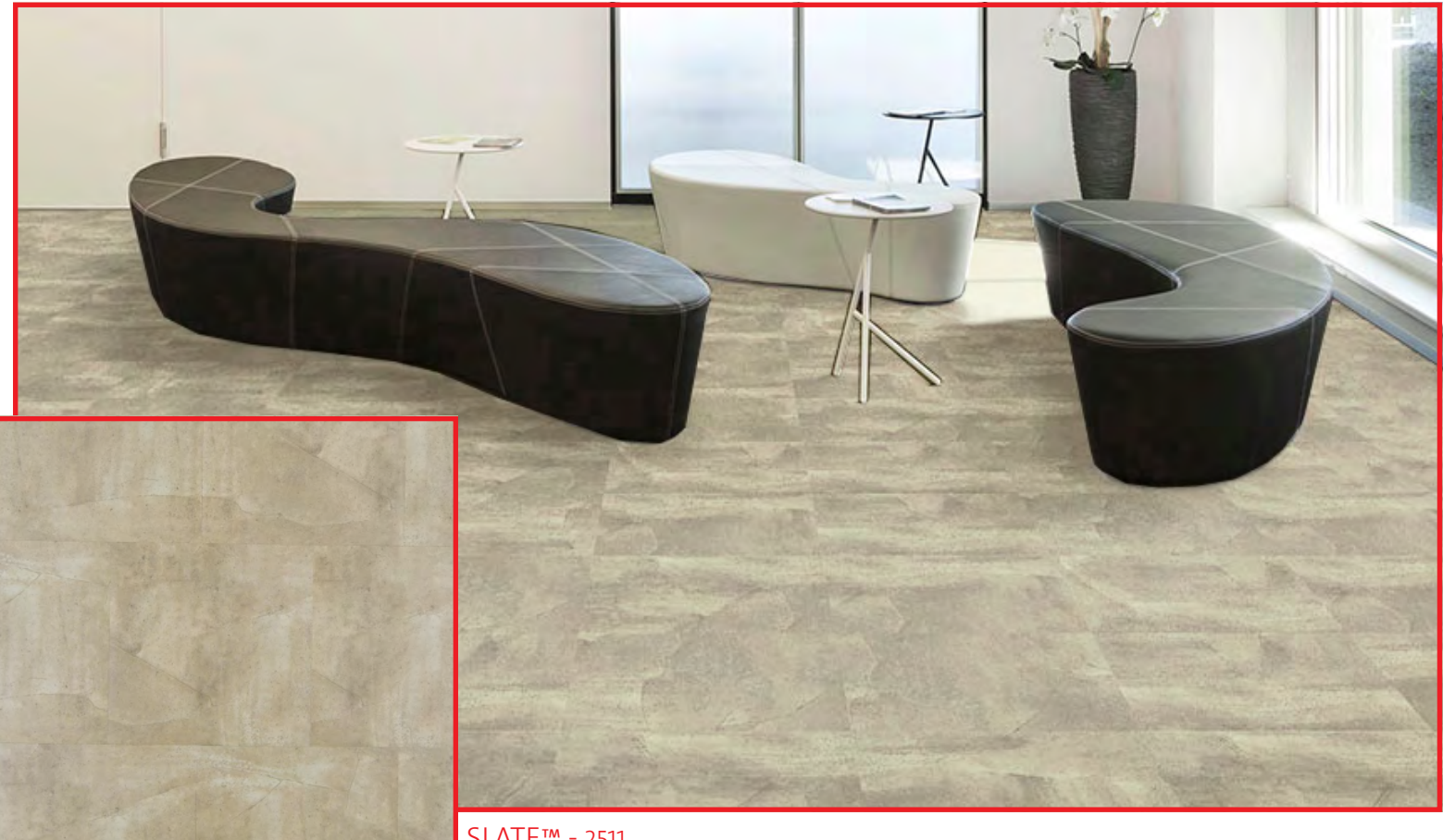
SLATE™ - 2511 AVAILABLE IN 4 COLORS