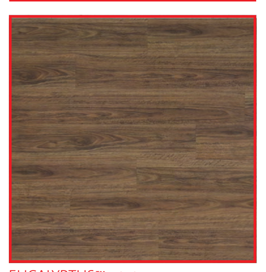
EUCALYPTUS™ - 2505 AVAILABLE IN 6 COLORS