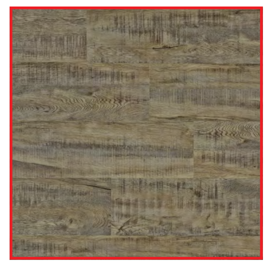
AGED OAK™ - 2504 AVAILABLE IN 3 COLORS