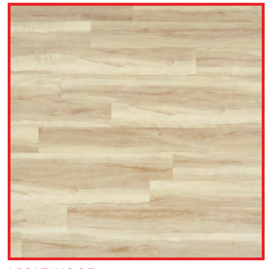
APPLEWOOD™ - 2506 AVAILABLE IN 5 COLORS