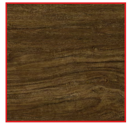
TEAK™ - 2509 AVAILABLE IN 4 COLORS