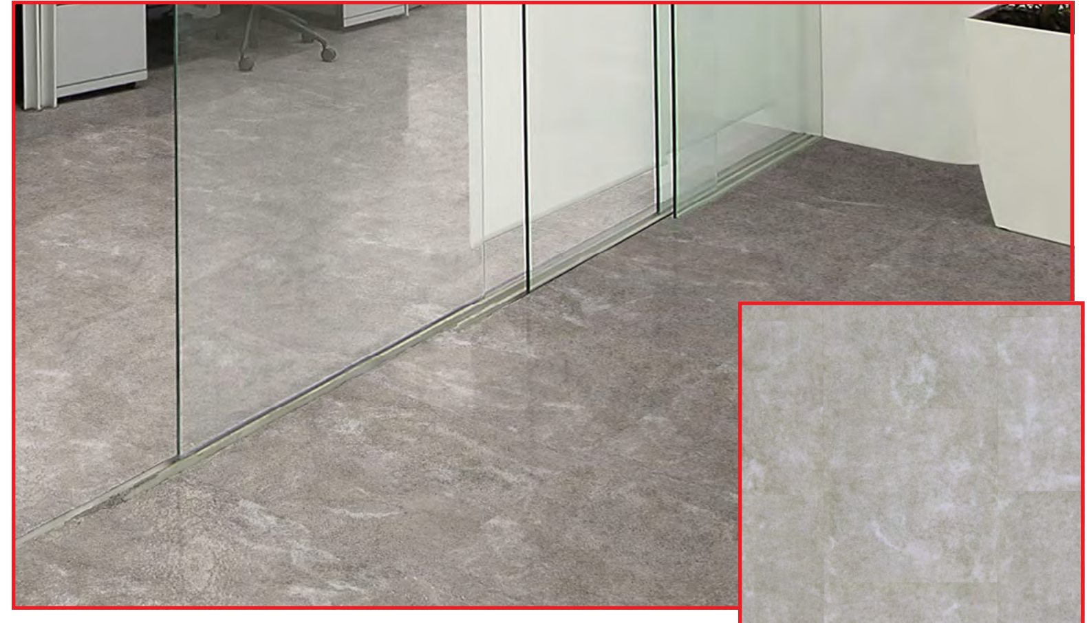
TRAVERTINE™ - 2510 AVAILABLE IN 6 COLORS