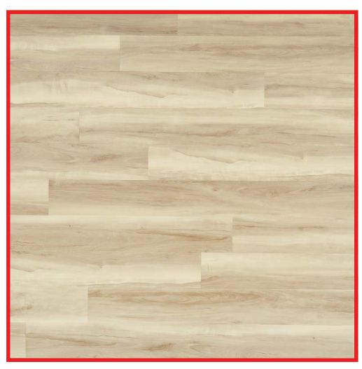
APPLEWOOD™ - 2506 AVAILABLE IN 5 COLORS