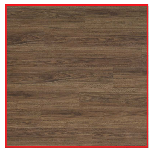
EUCALYPTUS™ - 2505 AVAILABLE IN 5 COLORS