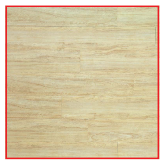
TEAK™ - 2509 AVAILABLE IN 4 COLORS