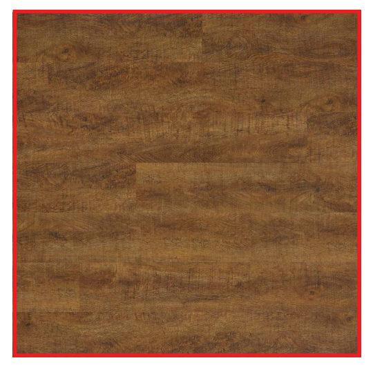
LAUREL OAK™ - 2507 AVAILABLE IN 6 COLORS