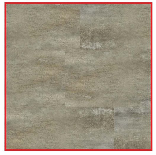
EMPIRE™ - 2502 AVAILABLE IN 3 COLORS