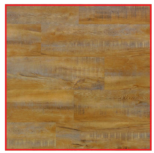
AGED OAK™ - 2504 AVAILABLE IN 5 COLORS