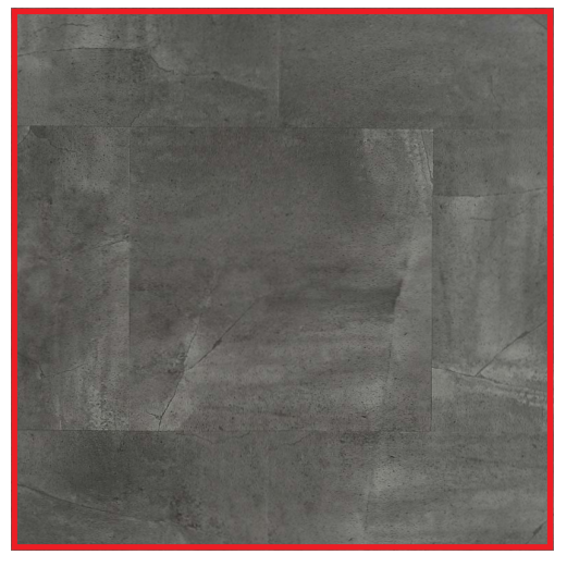
SLATE™ - 2511 AVAILABLE IN 4 COLORS