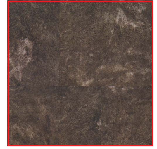
TRAVERTINE™ - 2510 AVAILABLE IN 6 COLORS