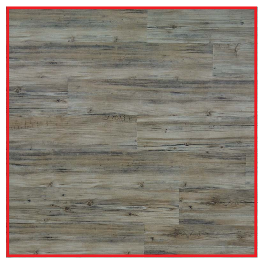
RUSTIC PINE™ - 2508 AVAILABLE IN 4 COLORS