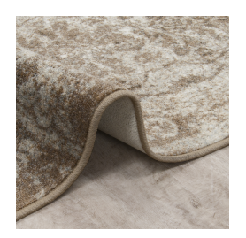
01 Antique Taupe