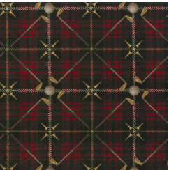
06 Tartan Green