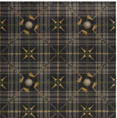
04 Bark Brown