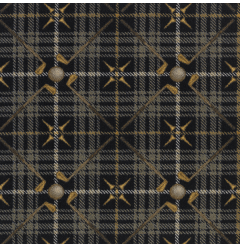
05 Flannel Gray