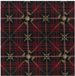
01 Lumberjack Red